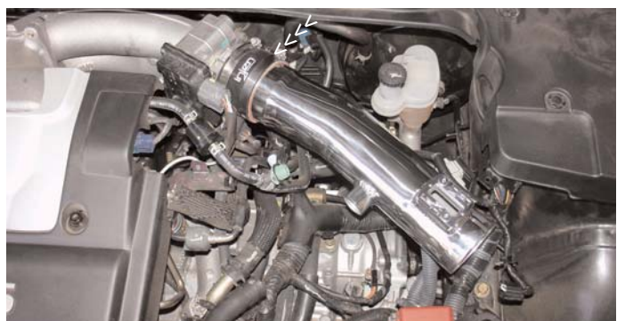
Insert the top end of the intake into the throttle body hose. Semi-tighten the clamp just enough to hold the intake in place.