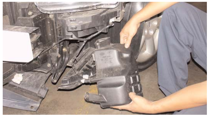
Once the bumper has been removed continue to disconnect and remove the plastic air intake resonator box.