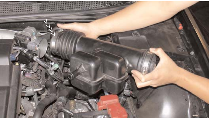
Loosen clamp at the throttle body and remove the air intake duct. At this point, it will be necessary to remove the front bumper. Remove 9 clips on top of the bumper, two 10mm screws on each side of the bumper, four additional sheet screws and 5 plastic clips.