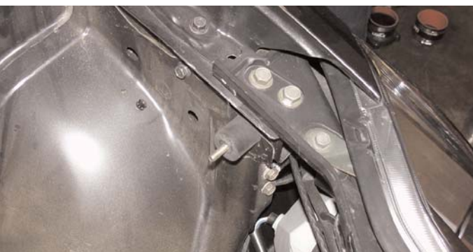
Take the vibra-mount and screw it into fender wall. Turn the vibra-mount into the fender wall until it bottoms out.