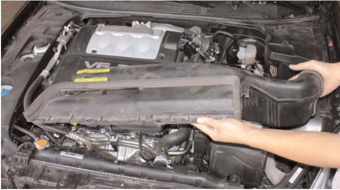
Remove the front air scoop laying over the radiator.