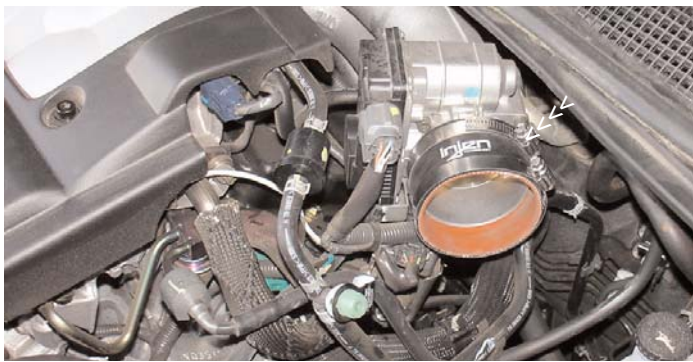
Press the 3 1/8" straight hose over the throttle body and use two clamps. Tighten the clamp located over the throttle body at this point.