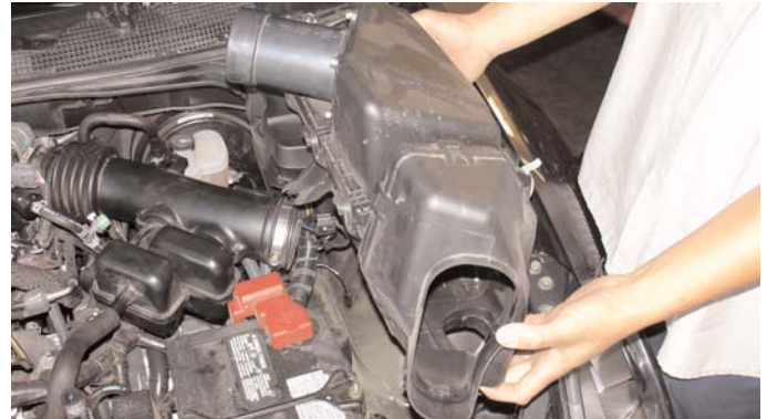
Loosen and clamps and bolts and remove the stock air intake box as shown above.