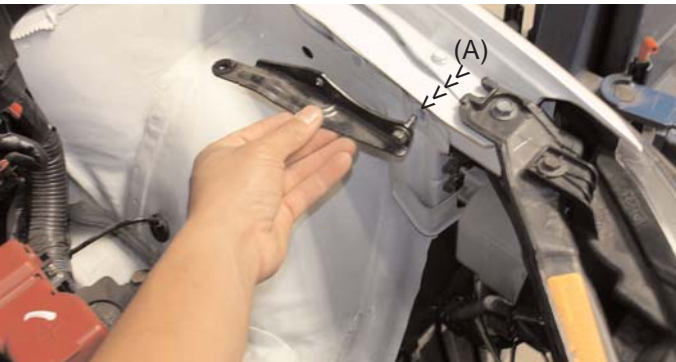
The bracket used to hold the stock air box in place will no longer be used. Remove the stock bracket to make room for the m6 vibra-mount. New location for the vibra-mount (A).