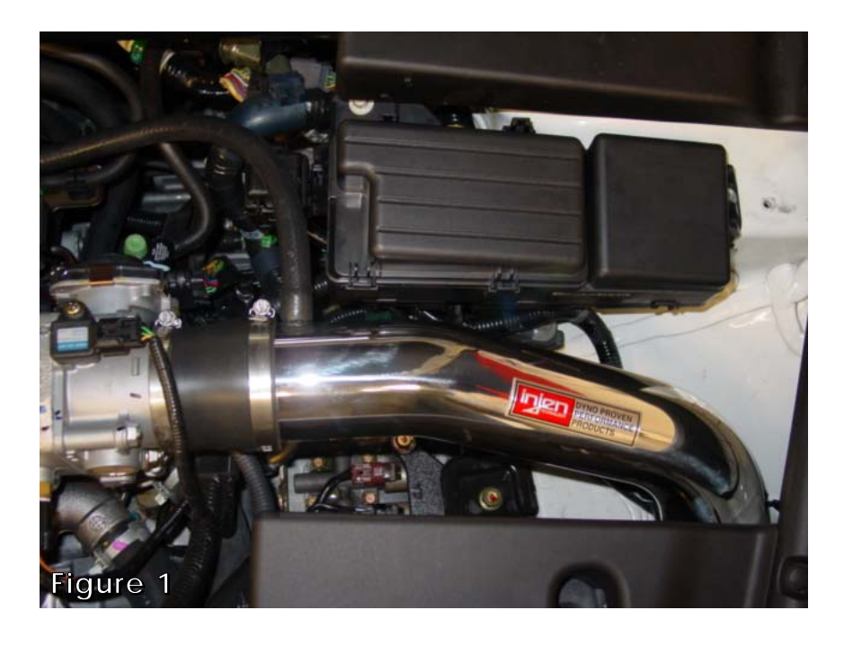
Now available, Hydro Shield by Injen Part Number X-1034

Note: This intake system was Dyno-tested with an Injen filter and Injen parts the use of any other filter or part will void the warranty and CARB exemption number.