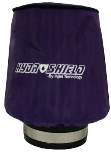
Hydro Shield Sold Separately