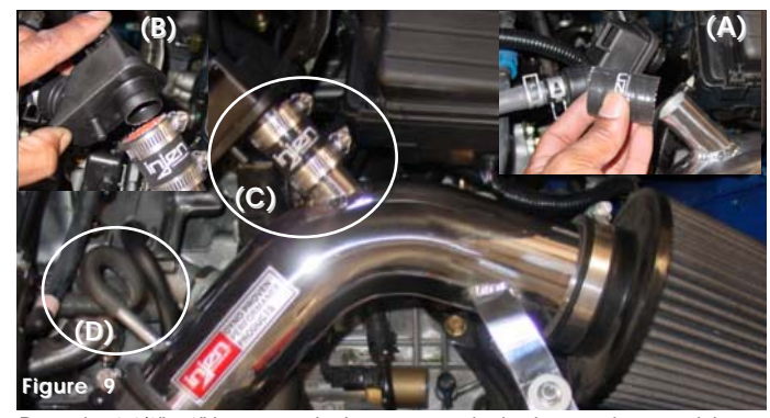
Press the 1 1/8" x 2" hose over the large port on the intake, use the two mini clamps in this kit to secure the hose(A). Press the assembled vent chamber port into the large hose on the intake(B). This illustration shows a filter on the end of the intake to be used as a short ram.