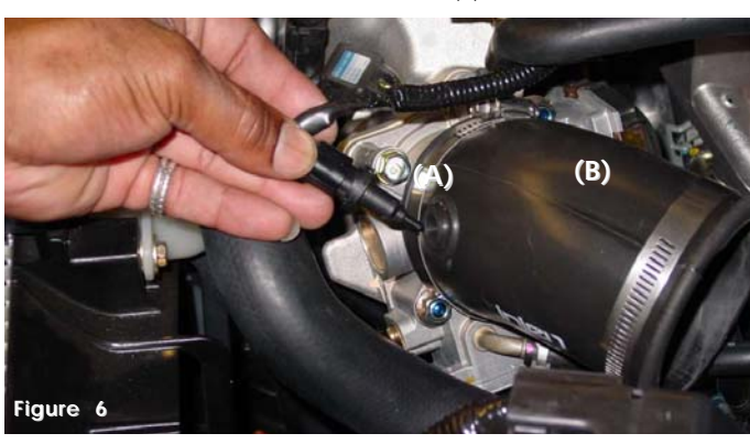
Press the sensor grommet in this kit into the hole in the elbow. Place the clamps over the beaded elbow and press the assembled elbow over the throttle body(B). Position the elbow in the correct direction and press the air temperature sensor into the sensor grommet (A).