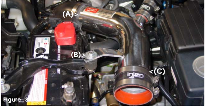
Press the primary intake into the elbow on the throttle body(A) and line up the bracket on the intake to the vibra-mount stud(B), use the m6 nut and washer to hold the intake in place. The 3" hose on the end of the intake is only used on the RD1680 for the secondary intake (C).