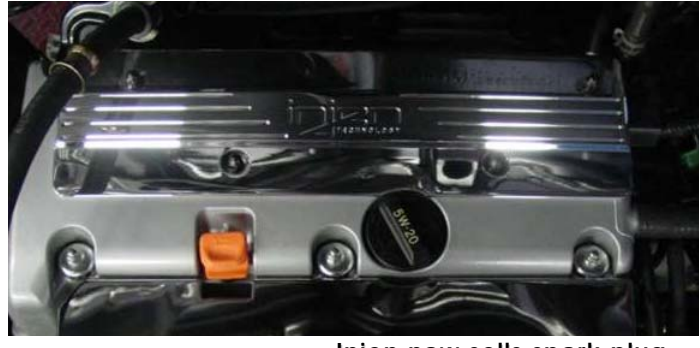
Injen now sells spark plug covers for this application. Part# IC1475