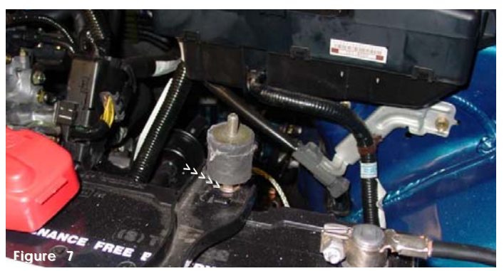
Take the male/female vibra-mount and screw it over the threaded battery post. Do not bottom out the vibra-mount a full 20 turns will be more than enough.