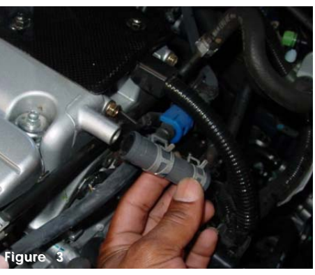
Remove the breather hose from the PCV pipe and press it over the crankcase port. Use the stock hose clamps to secure the lines in place.