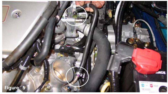
Coolant line (B) is reused to close the loop between the thermostat housing port and the throttle body port. Reuse the stock hose clamps to prevent any slipping.