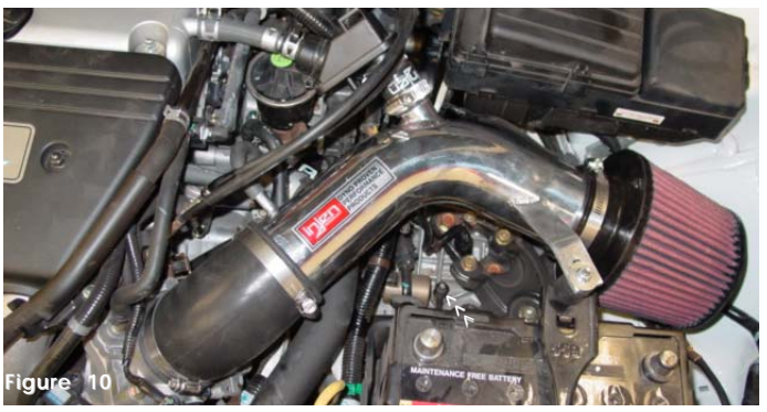
Congratulations! installation is now complete. Enjoy the added performance of your new intake system.