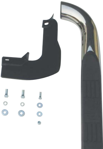
PASSENGER FRONT -