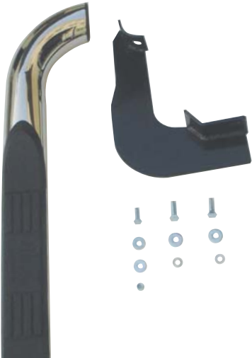
DRIVER FRONT -