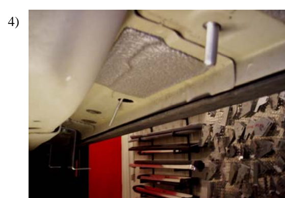
Photo of rear bolt after being installed. NOTE: It may be easier to install by putting a slight bend in the wire.

Remove the reward rubber plug and insert the bolt with a wire through the hole as shown. "Fish" the wire towards the rear of the vehicle and insert the bolt through the rear hole.