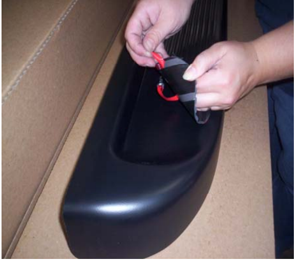
Position step tread where you want it. Then holding step tread in place remove adhesive cover one row at a time and press firmly to hold in place.