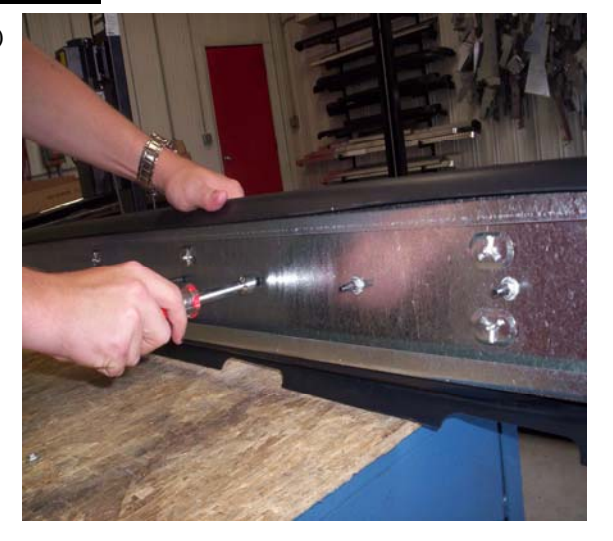
Tighten using 7/16 nut to step pad post. Just snug nuts do not over tighten.