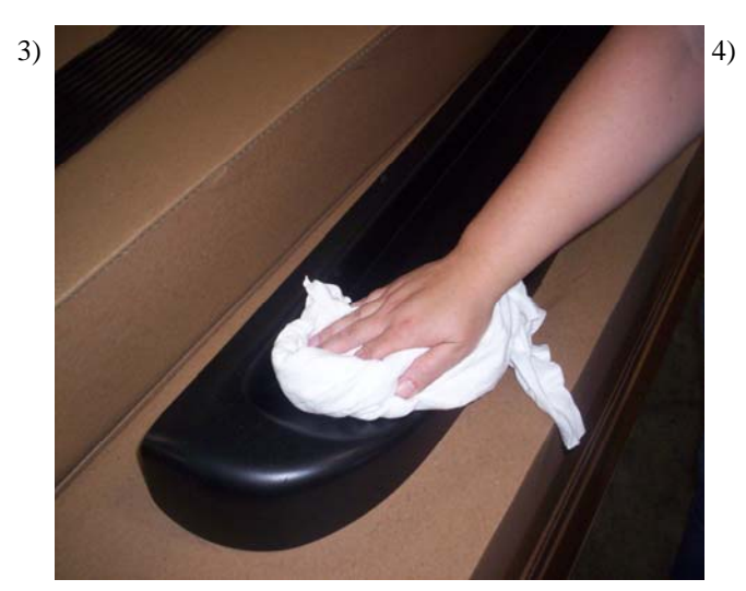
Wipe off surface where step tread will be placed.