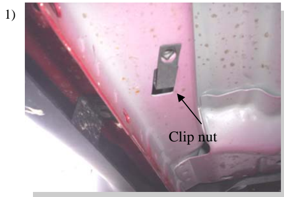
Insert clip nut as shown in factory holes at 12", 36" and 60" on underside of vehicle.