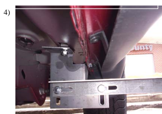
Attach angle support (3124F) to FL122 using 5/16" bolts and nuts. Snug but do not tighten at this time