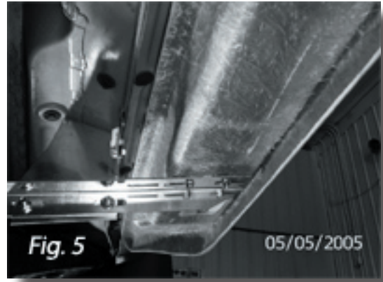
(Fiberglass Board Shown)

7. Attach board to 3124 using 3/4" short self drilling screws. (see Fig. 5) Do Not attach lip of board to body. ABS board is attached with brackets only.