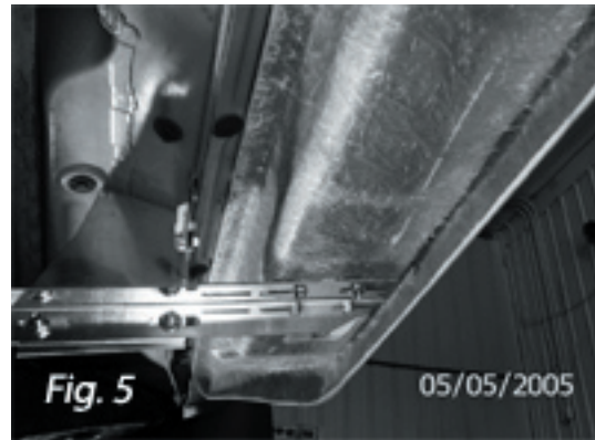
(Fiberglass Board Shown)

7. Attach board to 3124 using 3/4" short self drilling screws. (see Fig. 5) Do Not attach lip of board to body. ABS board is attached with brackets only.