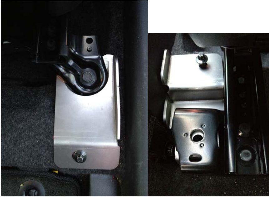
View of Front Outer

Step 5- Lay down the 4 black brackets under the seat so the 4 factory holes lineup (you can choose to remove your seat but it is not necessary) Parts are etched with “O” for outer (towards the outside of the car) and “I” for inner (towards the center of the car). The arrows always should point towards the front of the vehicle