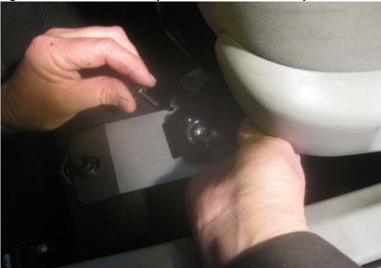
(View of the front of the seat)

Step 6- Start by finger tightening the rear outer factory hole with the factory bolt (closest to the outside of the car) then move to the rear inside and continue in a counter-clockwise pattern. You will finger tighten all of the factory bolts into the factory hole locations..