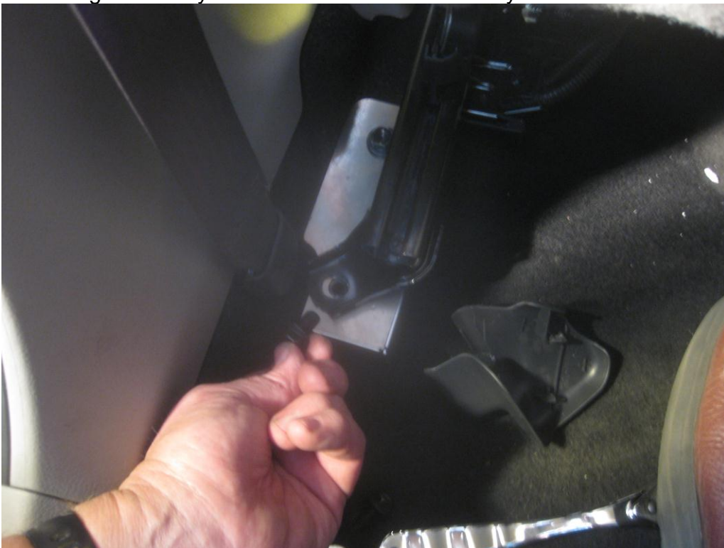
(View from backseat)

Step 8- Slide the factory seat all the way forward and go the backseat of the car to secure the last 2 remaining ExtendMySeat bolts into the 2 ExtendMySeat holes.