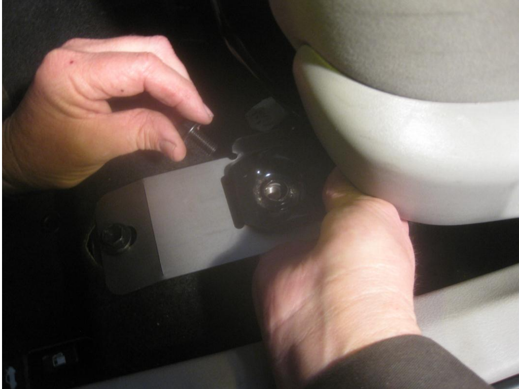
(View of the front of the seat)

Step 7-Line up the factory seat to the new extended hole locations (4" back from the factory holes). Finger tighten the 2 front seat "feet" into the new ExtendMySeat hole locations using the ExtendMySeat bolts.