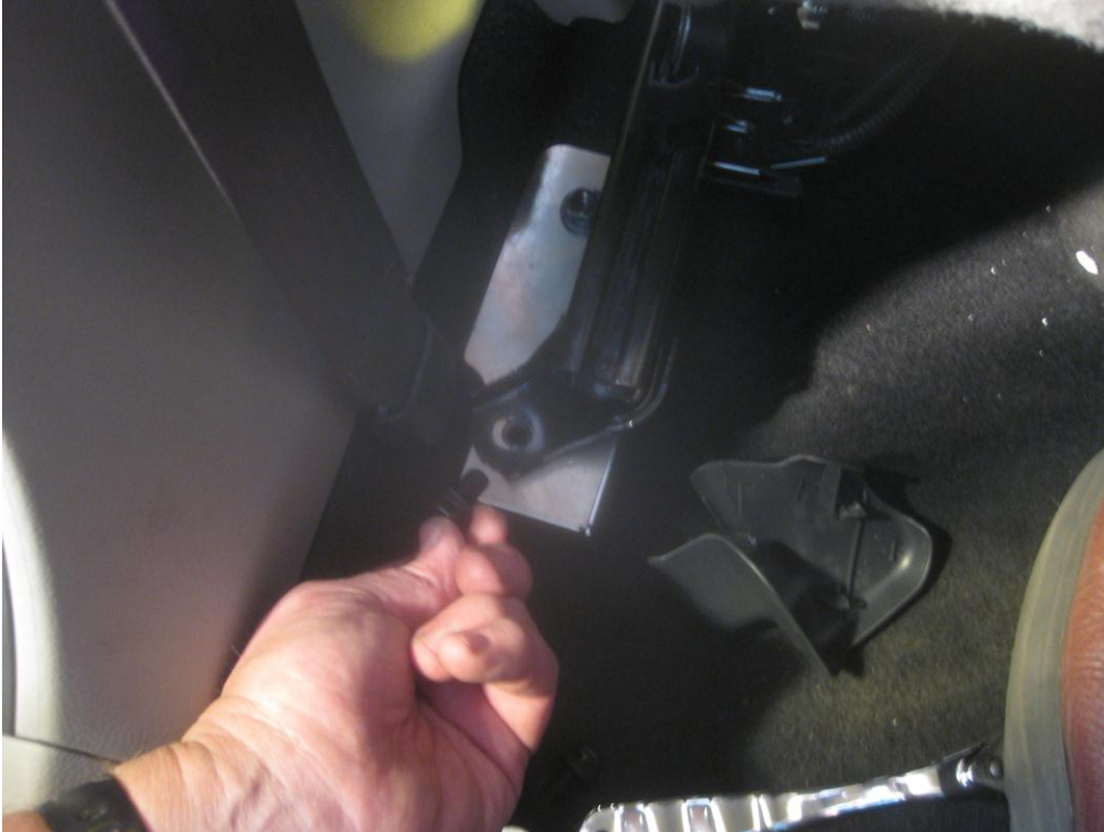
(View from backseat) Use 1 of the black bolts.

Step 8- Slide the factory seat all the way forward and go the backseat of the car to secure the last 2 remaining ExtendMySeat bolts into the 2 ExtendMySeat holes.