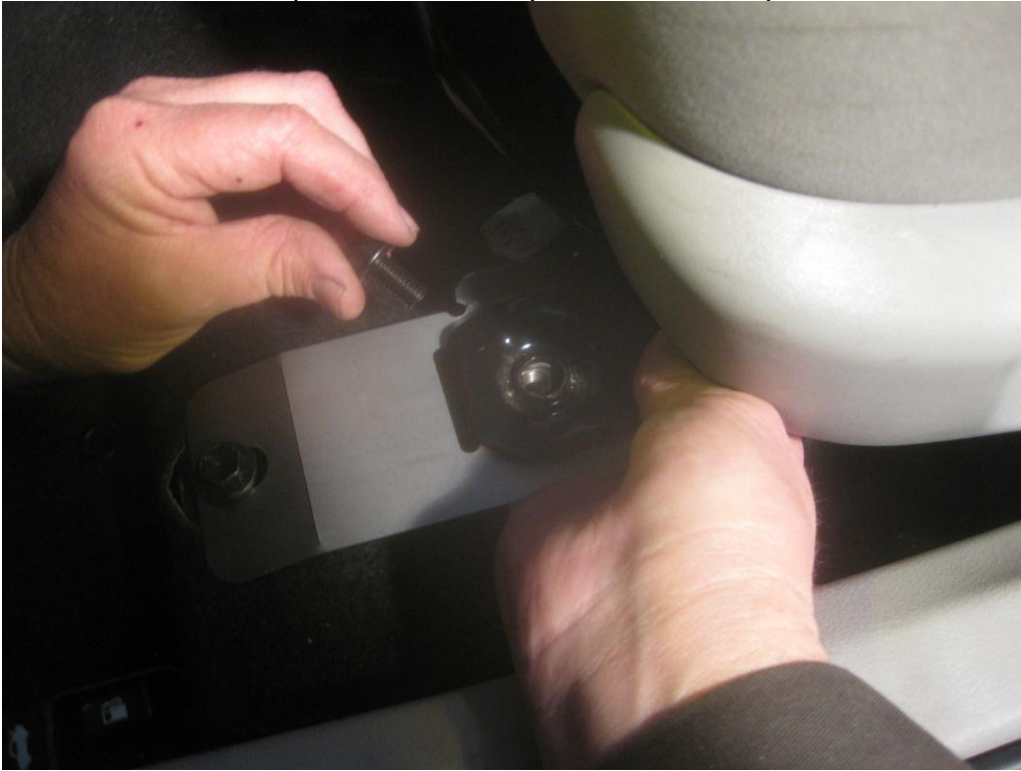
(View of the front of the seat)

Step 8- Slide the factory seat all the way forward and go the backseat of the car to secure the last 2 remaining ExtendMySeat bolts into the 2 ExtendMySeat holes.