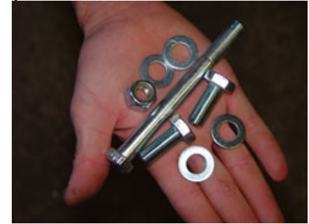
Rear mount hardware