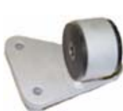
Right Hand Mount