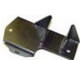
Right Hand Bracket