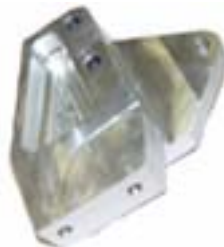
Left Hand Bracket