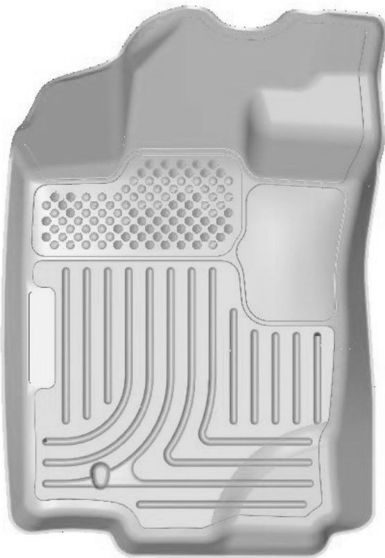
LEFT OR DRIVER'S