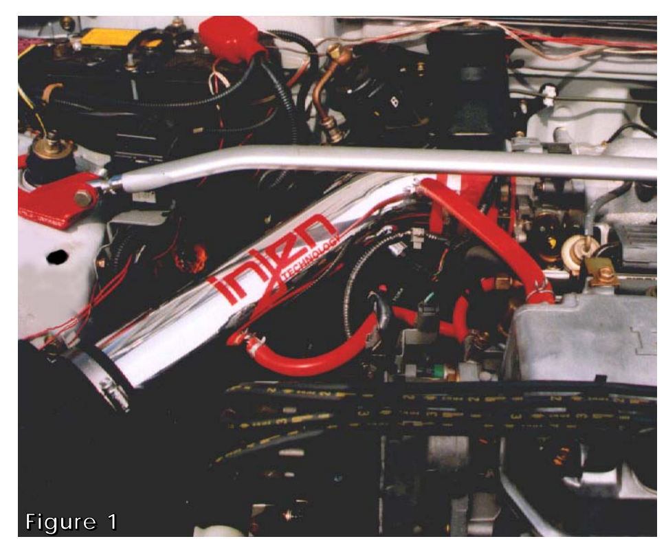
Now available, Hydro Shield by Injen Part Number X-1033

Injen Technology 244 Pioneer Place Pomona, CA 91768 USA