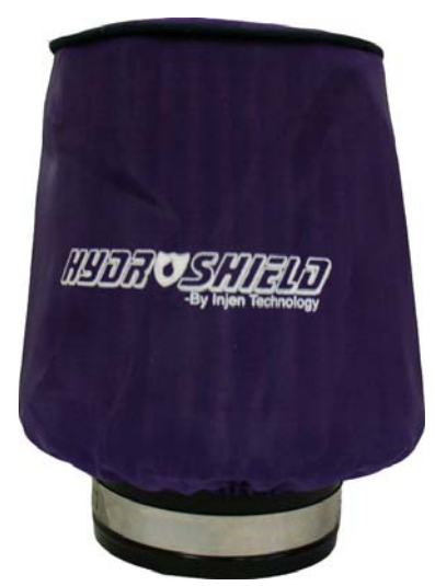
Hydro Shield Sold Separately