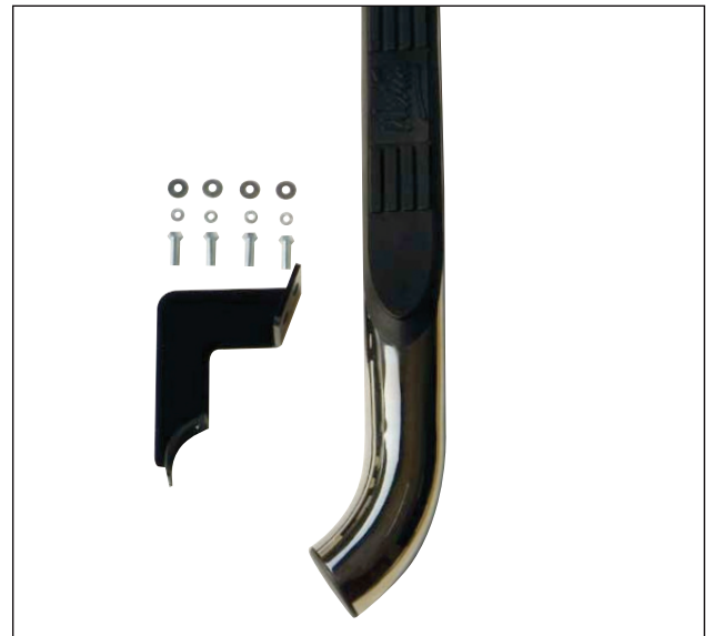
PASSENGER REAR -