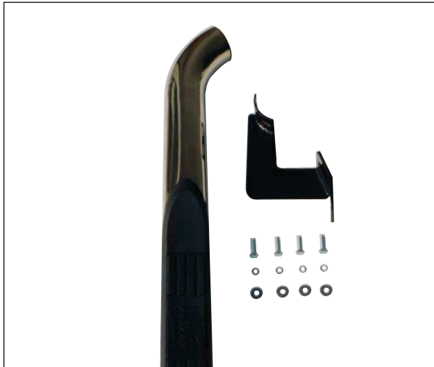
DRIVER FRONT -