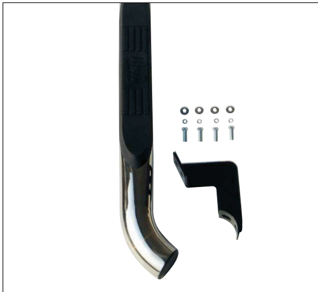
DRIVER REAR -