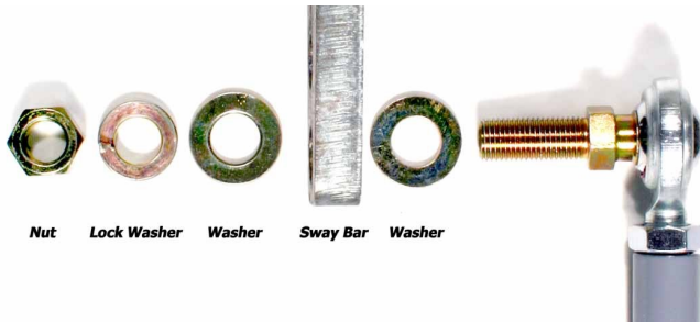
SHOWS SWAY BAR CONNECTION, AND PLACEMENT OF WASHERS