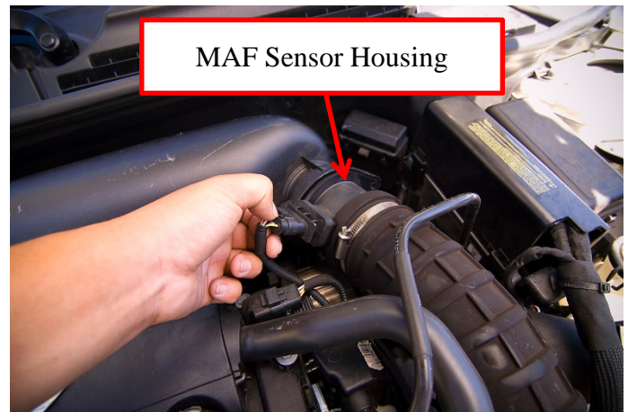
MAF Sensor Connector