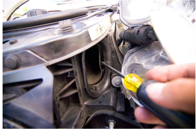
Figure 4: Removal of Fresh Air Hose