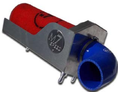
Foam Filter Shown

PO Box 3785 Mooresville, NC 28117 888-438-5767