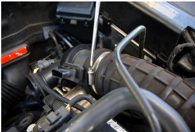
MAF Sensor Clamp