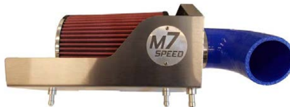
Pleated Filter Shown

M7 Speed engineers and manufactures the highest quality and best fitting Mini Cooper accessories and performance parts available anywhere on Planet Earth! Please inspect your parts when you receive them to verify everything is included and no damage has happened during shipment. Read these instructions completely BEFORE attempting to install this product. If you are not confident you can do the work described or do not have the tools or skills necessary please contact a local M7 dealer (listed on or website www.m7speed.com ) or a local automotive accessory installation center to perform this work. We acknowledge not everything is perfect but we work very hard every day to improve our products and make installations easier. If you have any comments please contact M7 Customer Service directly at 704-663-0094. We encourage and welcome all criticism. Thank you.