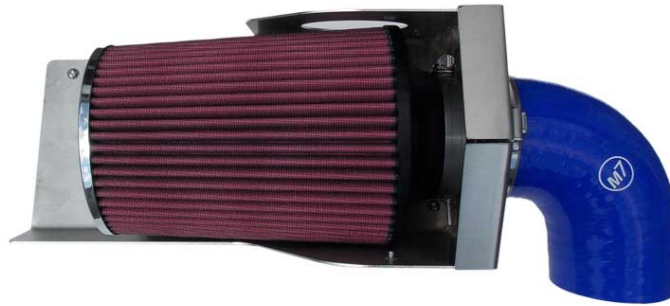
Pleated Filter Shown