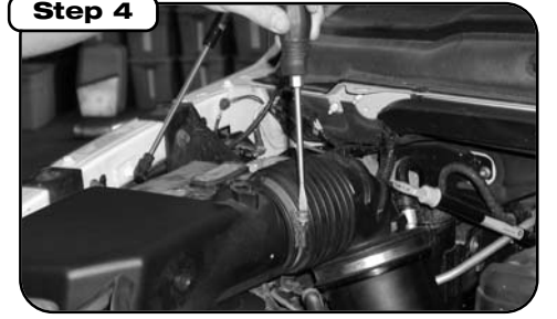
Loosen clamp holding factory tube to factory airbox and clamp at turbo. Remove complete system.

Install aFe intake tube and trim seal on the heat shield, be sure to install in the orientation shown. Install heat shield into engine compartment but do not attach any bolts. The bottom louvered panel must be positioned above the aluminum A/C line