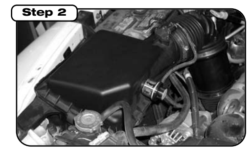
Complete stock intake. Make sure that the engine has sufficiently cooled down prior to starting installation of this kit.