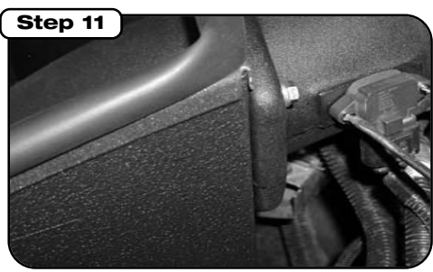
Install intake temperature sensor that was removed from the airbox onto the aFe intake tube using provided hardware and gasket, then tighten. Orientation does not matter on the temperature sensor. Re-connect factory harness to the temperature sensor.