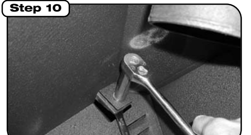
Using provided bolts, locking nuts and washers on both sides of the bolt, fasten lower tab on heat shield and slotted hole to the existing rubber mounts. Be careful not to over-tighten, it is only necessary that the rubber mounts be slightly compressed. Fully tighten shroud.

Using the bolt removed from the fan shroud earlier, secure the heat shield to the shroud using the tab extending from the heat shield, do not fully tighten.