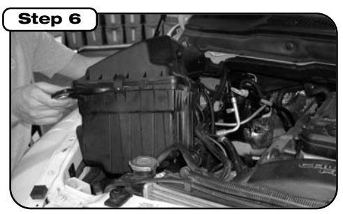
Remove factory airbox