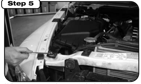
Using 10 mm wrench, remove the bolt that secures the factory airbox to the radiator bulkhead.