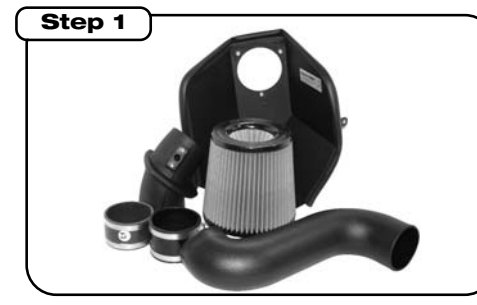
Complete kit components