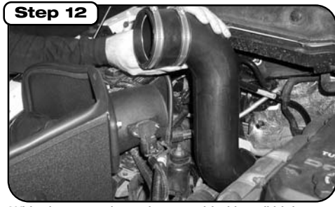
With clamps and couplers provided install high temp coupler at turbo side and 4"x3" urethane coupler at filter side, tighten using 5/16" nut driver. Install preoiled filter onto intake tube and tighten. Do not use any oil or grease when attaching filter. Reattach