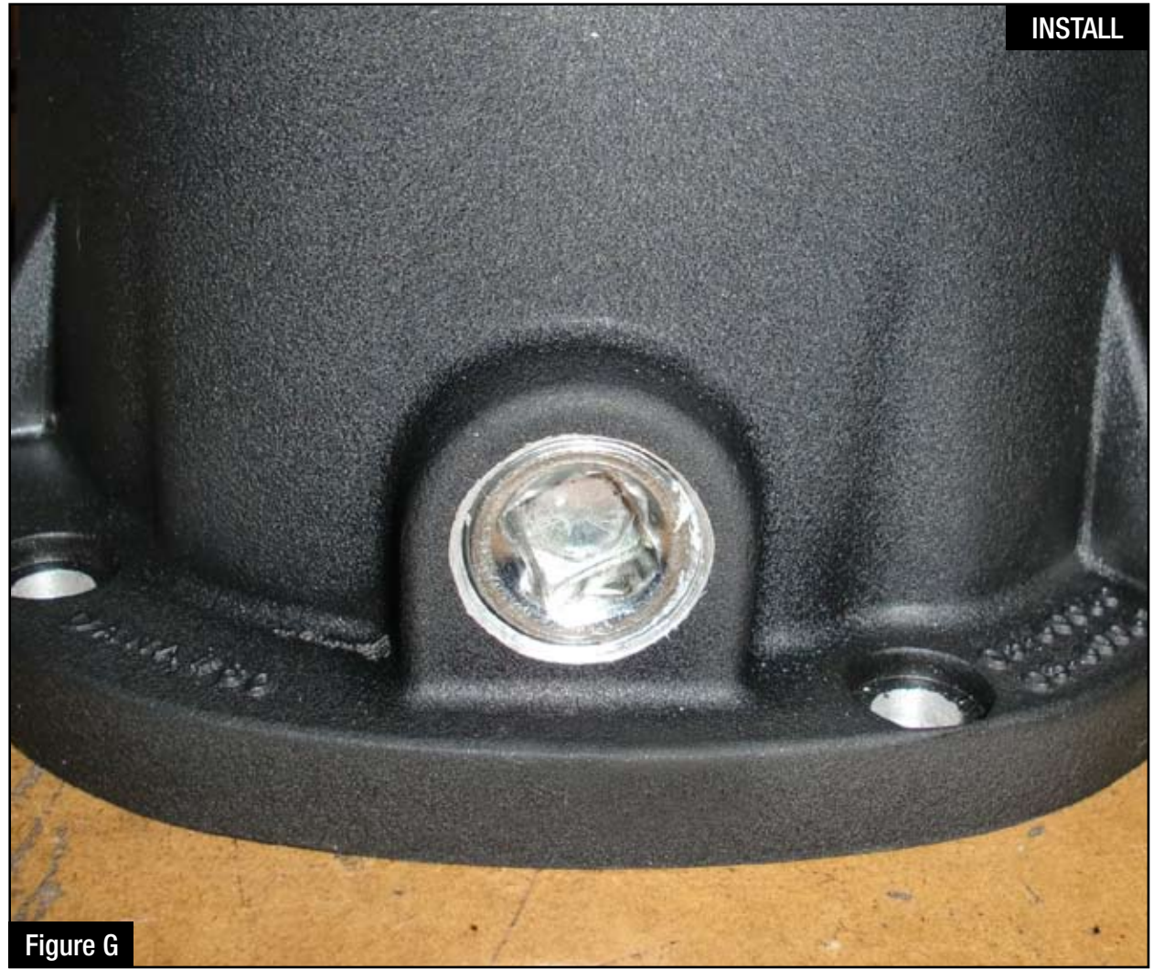
Refer to Figure G for step 10

Step 10: Install Drain plug on the bottom of aFe differential cover (torque to 50 ft.-lbs.).