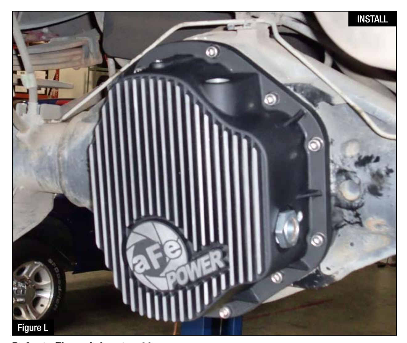
Refer to Figure L for step 20