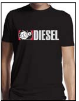
aFe Diesel Tee

P/N: 40-30221 (M) P/N: 40-30222 (L) P/N: 40-30223 (XL) P/N: 40-30224 (2XL) P/N: 40-30225 (3XL)