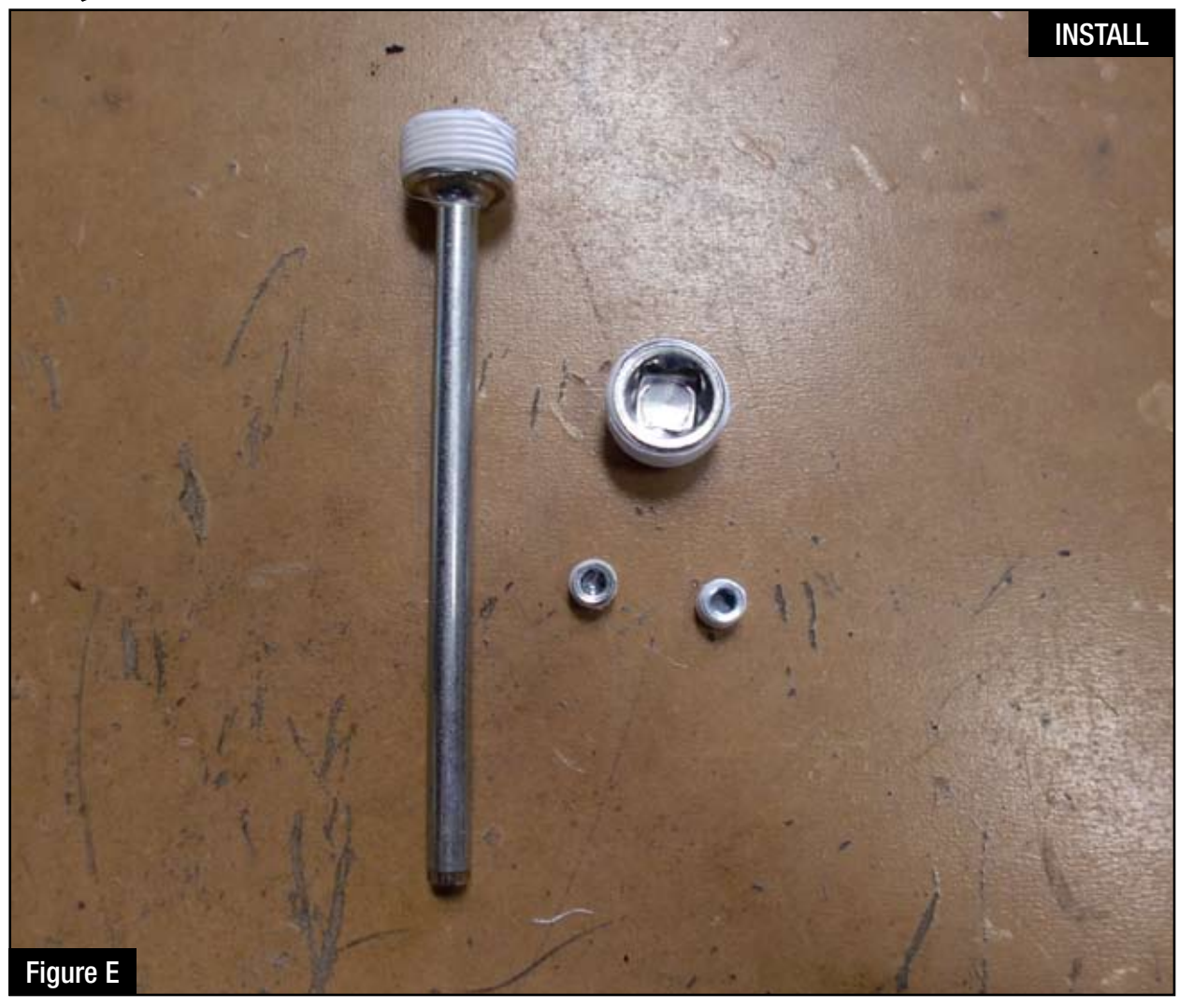
Refer to Figure E for step 8

Step 8: Apply teflon pipe sealant tape on the threads of all the plug components before installing.