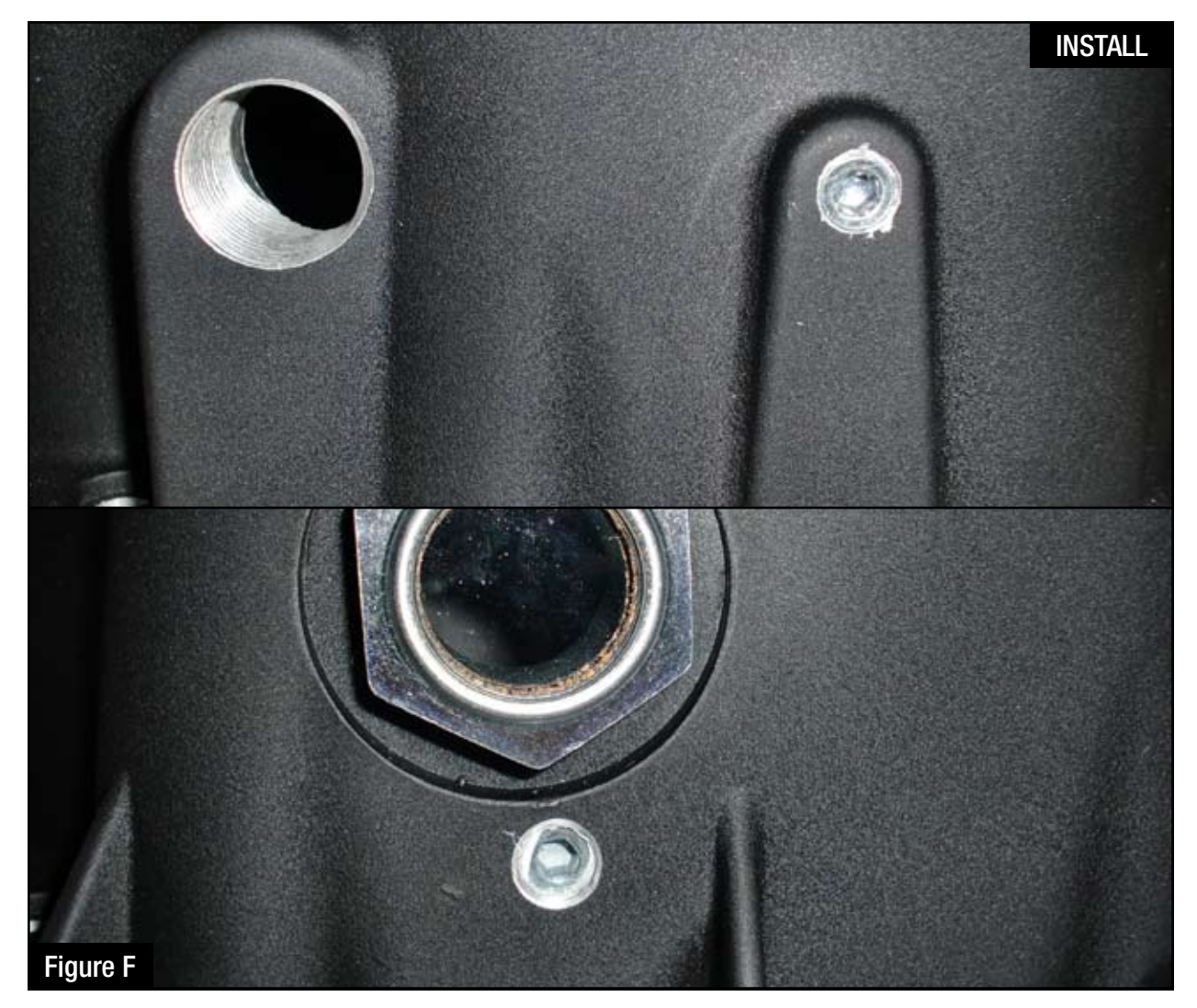
Refer to Figure F for step 9

Step 9: Install 1/8" NPT plugs on top and side of aFe differential cover (torque to 30 in.-lbs.).