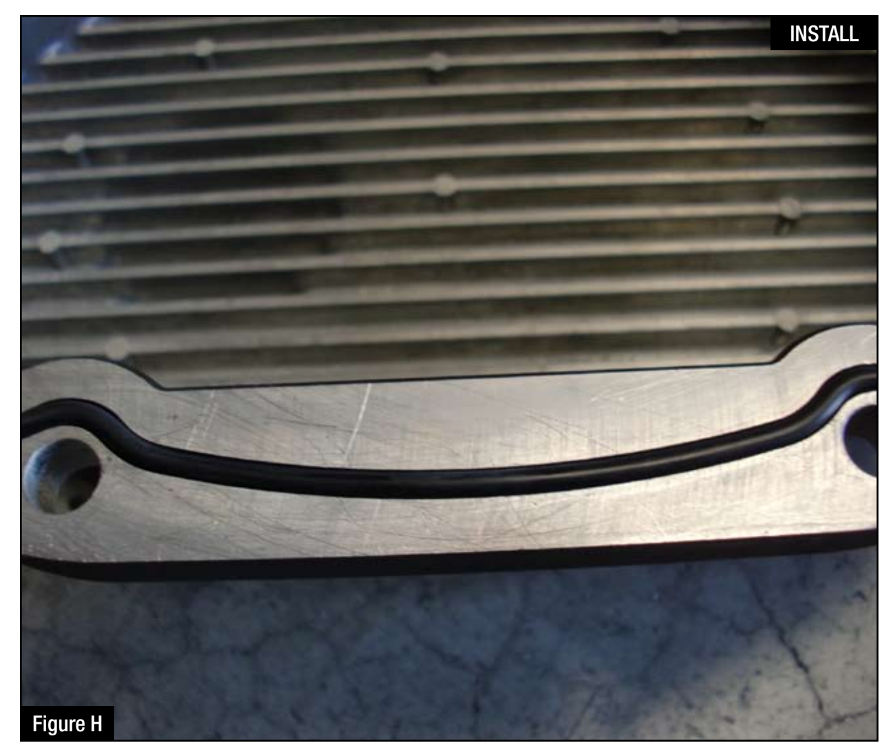
Refer to Figure H for step 11