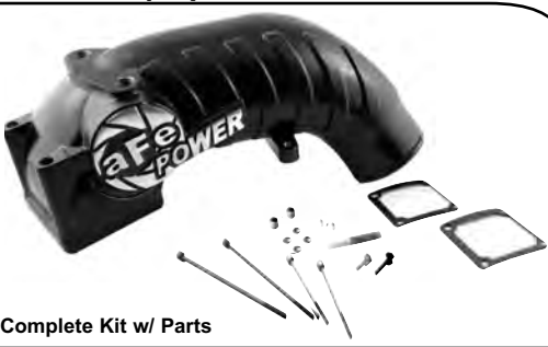
Complete Kit w/ Parts