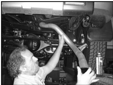
5. Using channel lock pliers pry the intermediate pipe hangers from the factory rubber isolators.