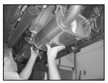
8. Insert the JBA intermediate pipe (A) hangers into the (2) rubber isolators then bolt the intermediate pipe to the factory catalytic converter assembly using the factory hardware.