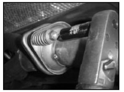
9. Slip 2 1/2" clamp with hanger (D) onto head pipe (A) and fit hanger into lower hole on rubber isolator.