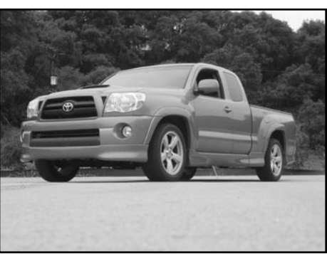
JBA Equipped - 2005 Tacoma X-runner 4.0L V6 5spd

Application 05 Tacoma 4.0L V6 Stainless steel