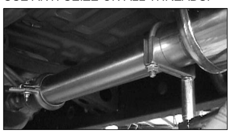
18. Position muffler making sure it is straight up and down. Tighten 2-1/2" clamp (D) completely using a 9/16" socket. NOTE: USE ANTI-SEIZE ON ALL THREADS