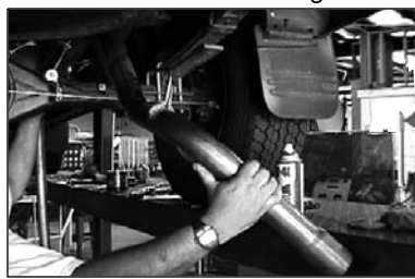
6. Remove tail pipe assembly from rear of vehicle.