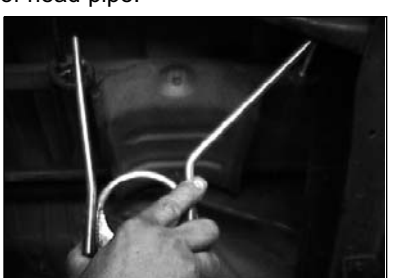
15. Install rear muffler clamp/hanger (E) into lower holes in rubber grommets.