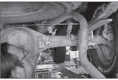
5. Remove tail pipe from rear of vehicle.