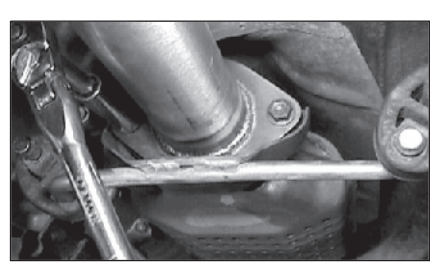
11. Bolt JBA head pipe (A) to flange using 14mm socket. NOTE: Oxyger sensor flange point s inward.