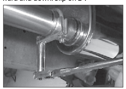
14. Support muffler and align straight up and down. Install 2 1/4" clamp (D) over 2-1/4î front muffler slip joint and tighten completely using a 9/16" deep wall socket. NOTE: Use anti seize on threads of clamps. See Notes #2.