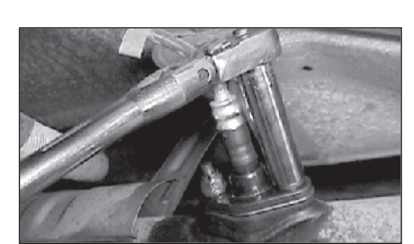
6. Remove oxygen sensor using a 12mm socket, save gasket.