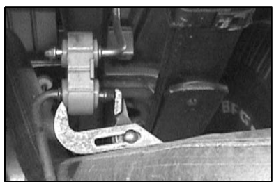
4. Spray lube on rear tail pipe hanger rod and remove from lower hole in rubber grommet using channel lock pliers.