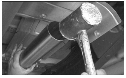
9. Install head pipe (A), aligning notch with locating pin. You may have to tap it on using a rubber mallet.