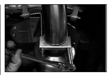
17. With tail pipe properly aligned, tighten rear muffler clamp/hanger (G) completely with 9/16" deep wall socket. NOTE: Use anti-seize on all threads of clamp. See note #2.