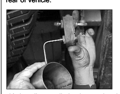
16. Install rear tail pipe hanger into lower hole of rubber grommet. Rotate tail pipe (C) to align rear hanger rod.