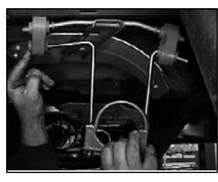
10. Install rear 3" muffler clamp/hanger(G) through lower holes in rubber grommets with longer rod towards driver's side.