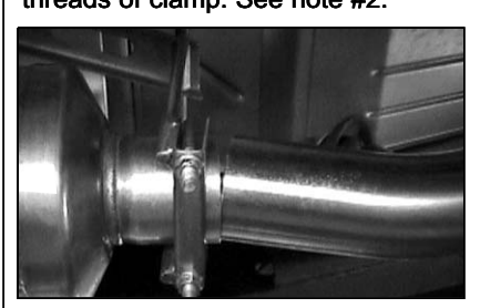
15. Install tail pipe (C) from rear of vehicle and slip into rear of muffler (B). NOTE: Make sure that the end of the tail pipe with the hanger rod is at the rear of vehicle.