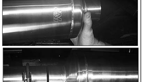
12. With JBA logo facing rear of vehicle, install muffler (B) over head pipe (A) making sure muffler bottoms out on slip joint.

13. Using the 3" clamp (F), tighten clamp completely using 9/16"deep wall socket.