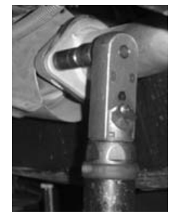
11. Install the 2-1/4" clamps (F)

10. Then fit the Cross over (A) into the Y-pipe (B) and then connect it to the factory catalytic converter.