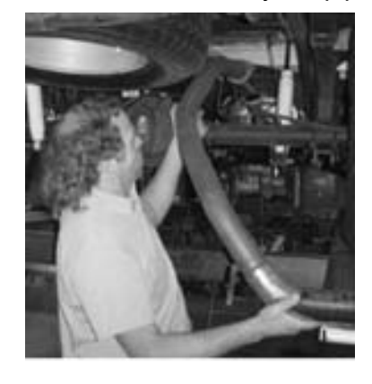
5. Remove the nuts attaching the exhaust system to the catalytic converters.