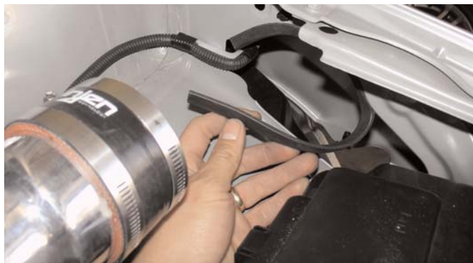
Injen has supplied a 12" vinyl trim to be placed around the resonator opening. This will prevent any damage to the secondary cold air intake system.