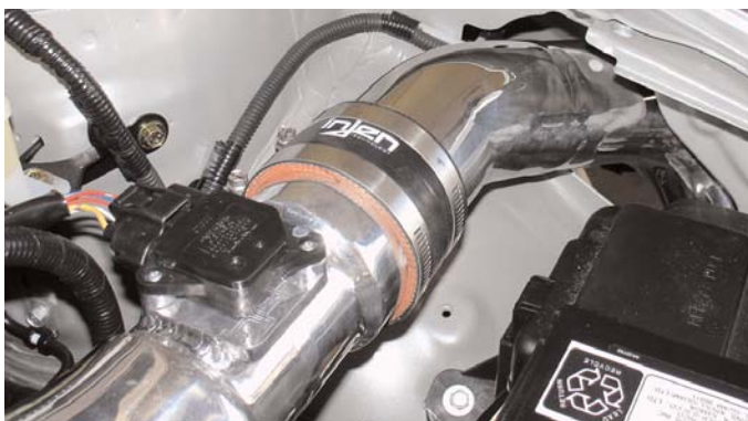
The primary and secondary intakes are joined together, using the 3" straight hose and fastened with the clamps once they have been aligned.