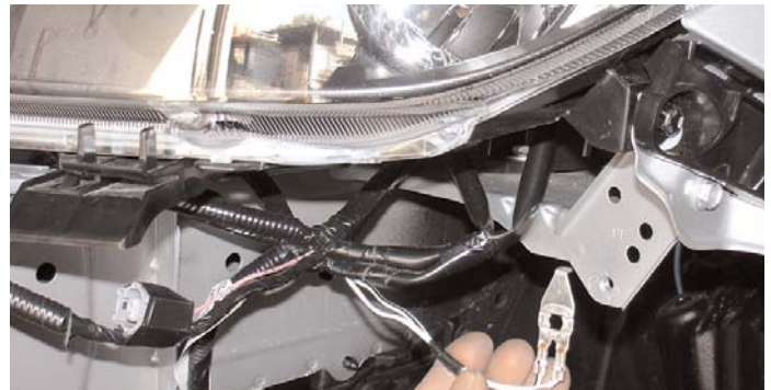
Locate the grounding wire on the bracket connected to the frame. This ground will be relocated in order to place the second vibra-mount in place.