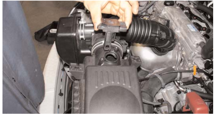
Remove the MAFS from the stock air intake box and set it aside for further instructions.