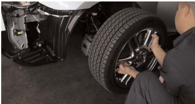
Once the stock air intake box, air duct, battery and bumper has been removed from the engine compartment, proceed to remove the driver side wheel.