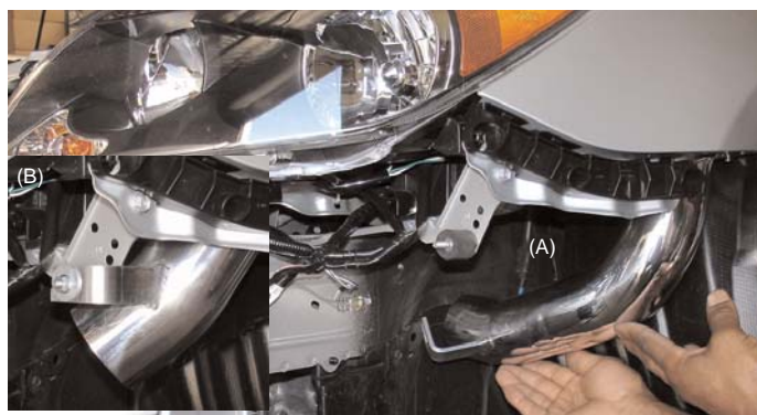
The secondary intake system is inserted through the bumper area. close attention is placed on the resonator opening when going up and into the engine compartment(A). Once the intake has been fitted, the top end is butted up against the primary intake. Now, align the bracket to the vibra-mount stud and use the fender washer and flange nut to secure them(B).