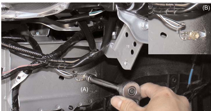
The grounding wire is now being relocated to the frame of the TC(A). The ground wire is now firmly secured in place(B).