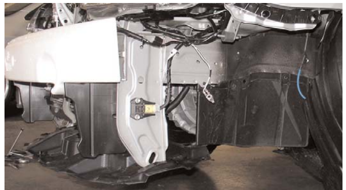
Remove the entire front bumper by removing all bolts and plastic clips holding the bumper in place.