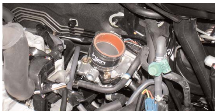
Place the 2 1/2" straight hose over the throttle body, use two clamps but only tighten the clamp on the throttle body.