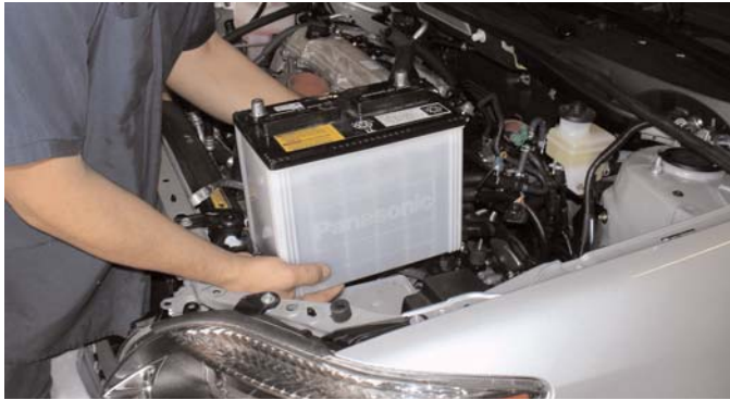
Remove the battery and battery tray from the engine compartment prior to starting this installation.