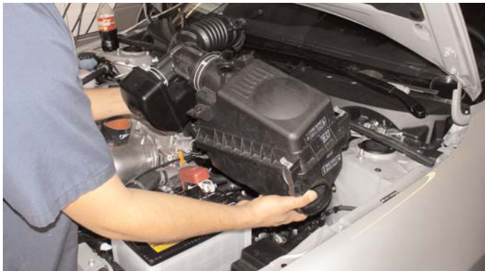
Loosen the clamp at the throttle body and disconnect the air intake box from the resonator duct leading into the fender well. pull the entire stock air intake box and duct from the engine compartment.