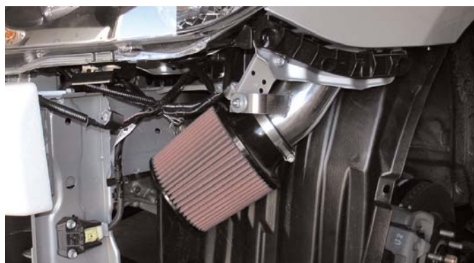
The filter is placed on the end of the secondary intake and fastened to secure the filter in place. Align the entire intake for proper fitting. Once proper clearance has been made through out the length of the intake, continue to tighten all nuts, bolts and clamps.