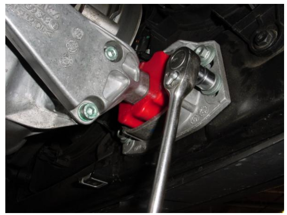
10. Position mount flush against cross-member and torque fasteners to 20 Nm (15 ft-lb).