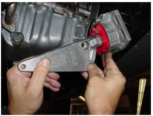
8. Install isolator into mount and re-position assembly for installation.