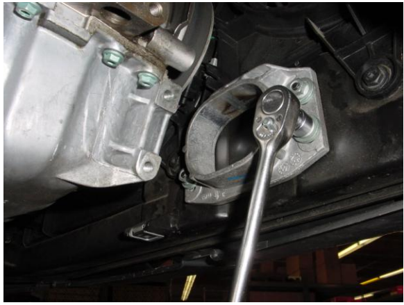
5. Remove three (3) nuts (13mm hex) securing mount to cross member and remove mount from vehicle.