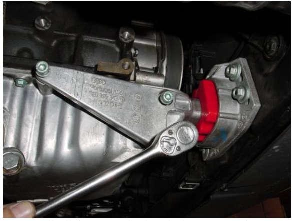
9. Install all fasteners by hand, then torque fasteners securing lever arm to oil sump to 20 Nm (15 ft-lb).