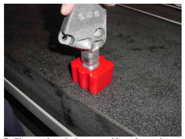
7. Place urethane isolator on stable surface and press torque arm into mount in orientation shown.