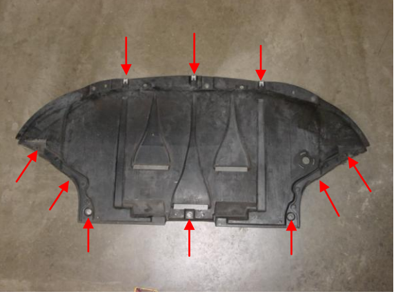
2. Remove diffuser by removing three (3) front, three (3) rear, two (2) left and two (2) right side fasteners.