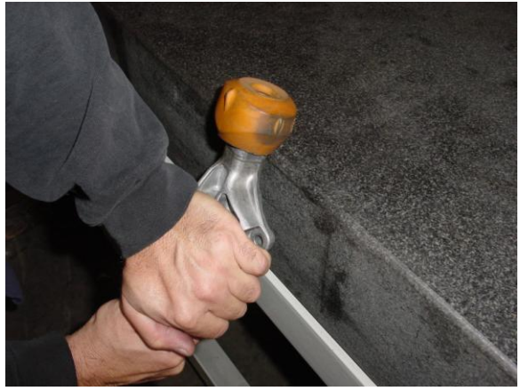
6. Separate isolator from torque arm by placing isolator on edge of stable surface and pull/push down to remove arm.