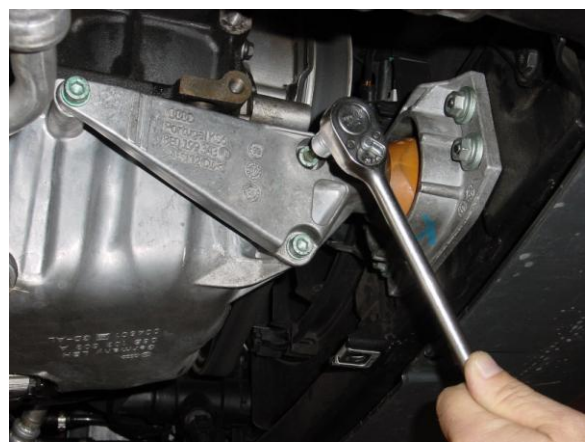
3. Remove three (3) bolts (6mm Hex driver) securing torque arm to oil sump.