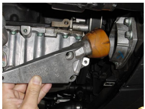
4. Remove torque arm from mount