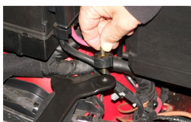
5. Install and tighten supplied rubber isolator onto left front air box mounting bracket.