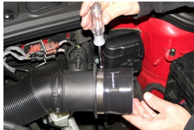
9. Install supplied silicone hose with smaller end onto MAF using supplied #52 clamp.