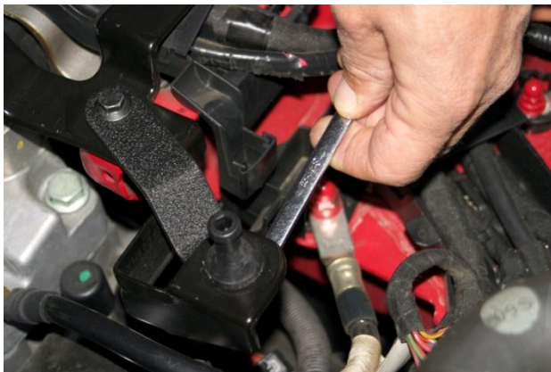
c. Now tighten nut and bolt.