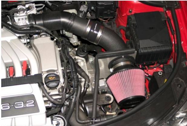
14. Install weather strip seal onto top edge of P-Flo bracket.