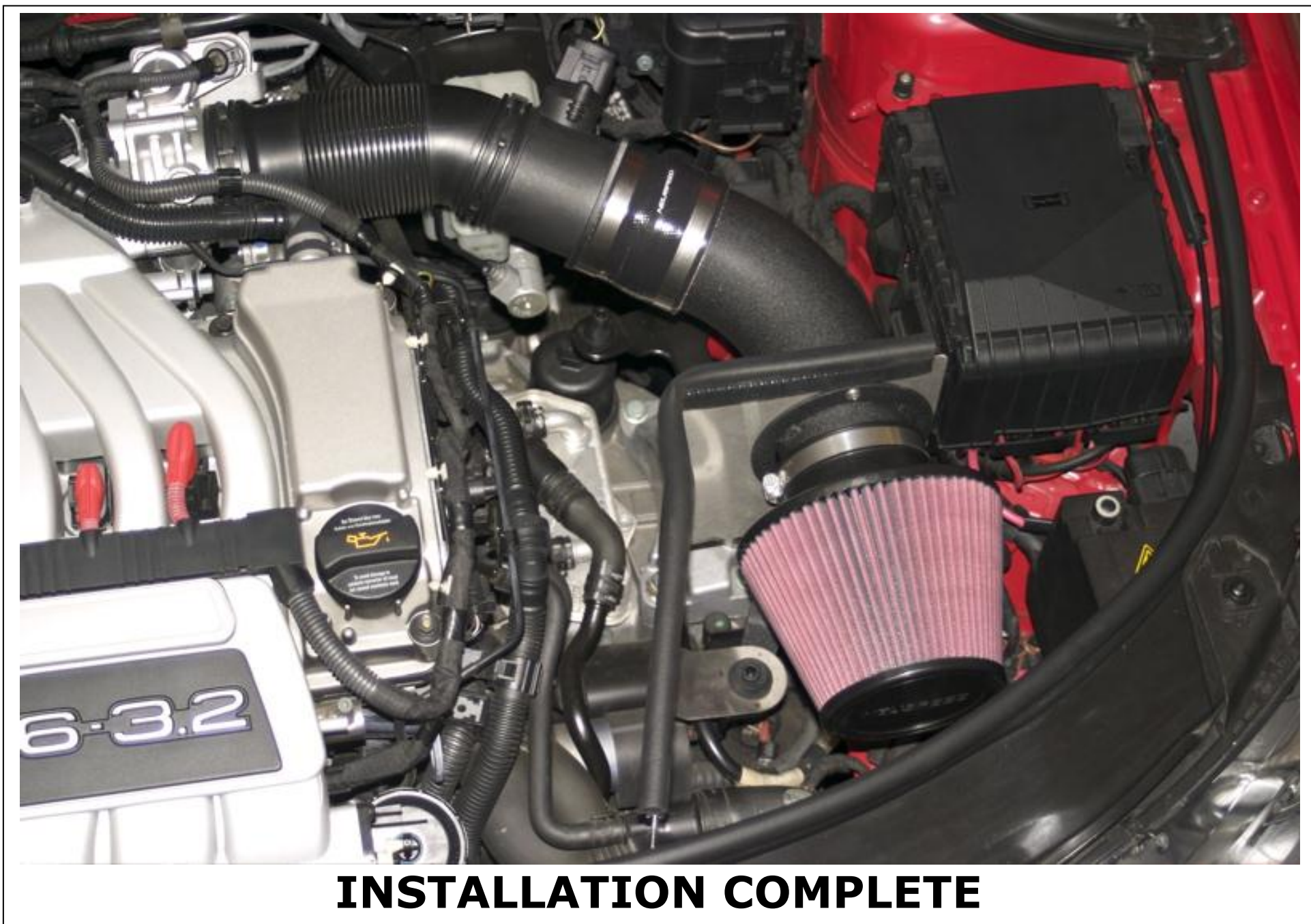
15. Installation is now complete. Double-check tightness of all connections and test drive carefully. NOTE: Double-check all clamps and connections after 50 miles of driving.