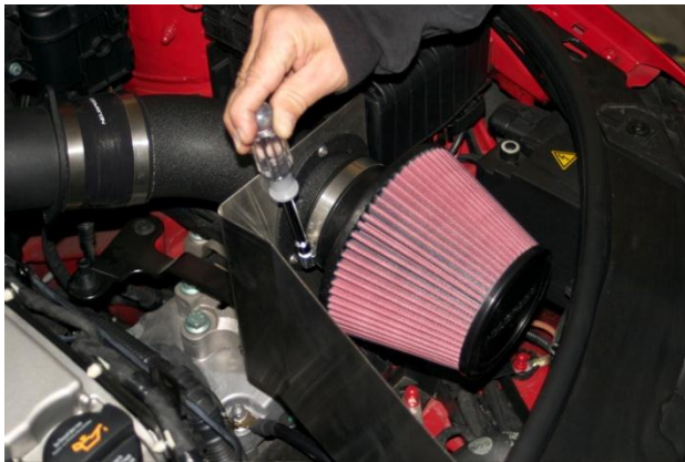
13. Install NEUSPEED filter.