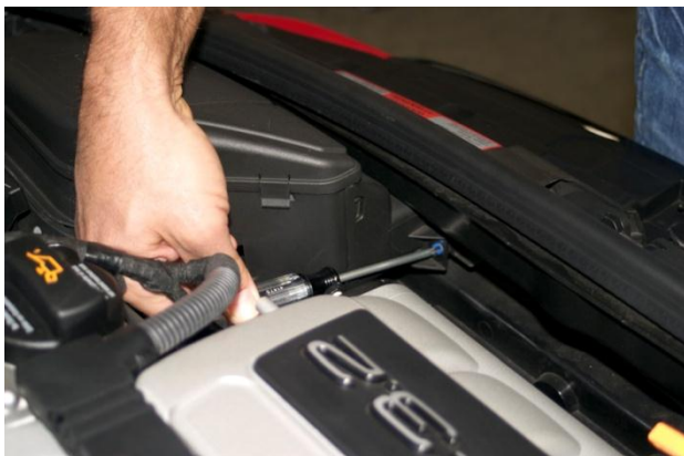
1. Remove air intake duct at radiator support. There are two (2) T20 Torx, one on each side.