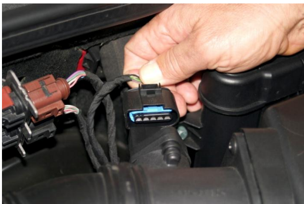
2. Disconnect electrical connector at MAF sensor.