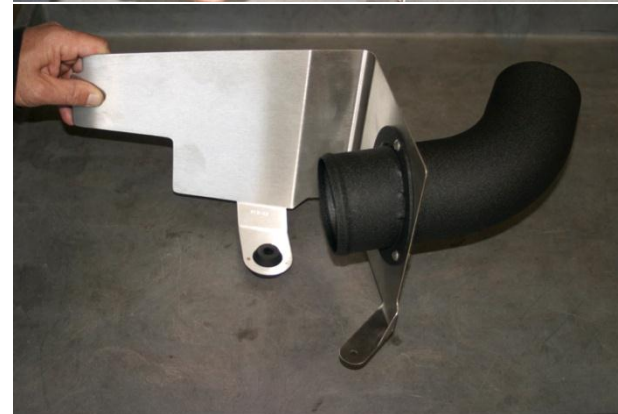
11. Install NEUSPEED intake tube to P-Flo bracket and tighten with supplied M6x12mm button head screws and nyloc nuts.