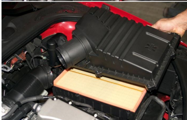
3. Using spring clamp pliers, disconnect air intake tube from MAF. Unscrew upper air box lid using Phillips screwdriver. Remove upper air box lid.