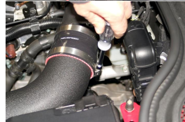
12. Loosely install supplied #56 hose clamp onto silicone hose. Install P-Flo bracket onto mounts while inserting tube into silicone hose. Install and tighten supplied acorn nut to retain P-Flo bracket and isolator. Tighten #56 hose clamp.