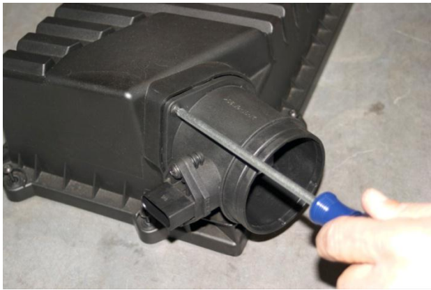
7. Unscrew and pull-out MAF from air box lid.