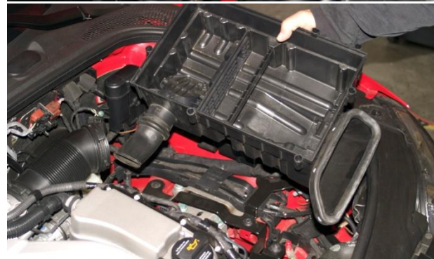
4. Unbolt left front corner of lower air box using 5mm hex key wrench. Lift off lower air box from two rubber mounting grommets and remove from vehicle.