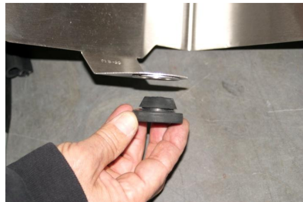
10. Remove rubber grommet from lower air box and install into hole of P-Flo bracket as shown.