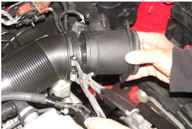
8. Reinstall MAF to factory tube and reconnect electrical connector. NOTE: Make sure there is ample clearance between MAF electrical connector and brake reservoir.