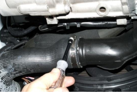
Loosen hose clamp using a 7mm nut driver or screwdriver at lower air charge pipe connection and disconnect from rubber hose.

Raise the front of vehicle and support with jack stand(s) under lifting points. NEVER WORK ON A VEHICLE ONLY SUPPORTED BY A JACK. Remove lower engine splash pan, (8) T25 Torx screws. NOTE: GTI shown in picture, other models may vary.