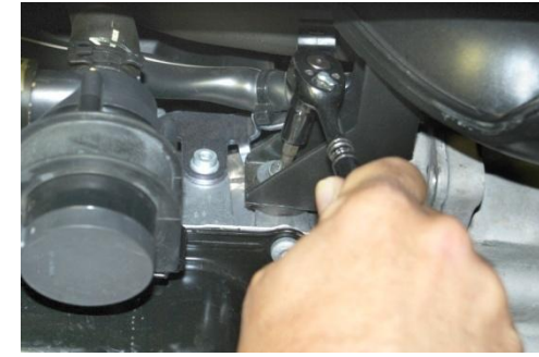
8. Unbolt lower air charge pipe mounting screw, T30 Torx. Pull-out pipe downward from underneath the vehicle to remove.