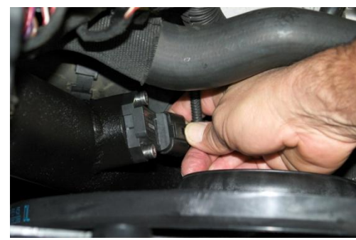
14. Reconnect electrical connection to pressure sensor. Double check complete installation.