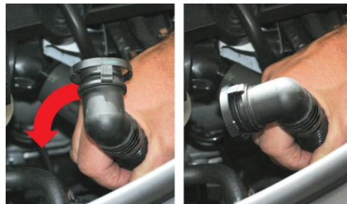
17. Rotate air pump fitting 90-degrees counter-clockwise.