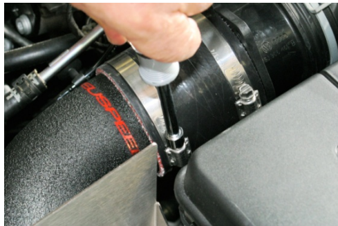
15. Tighten #48 hose clamp.