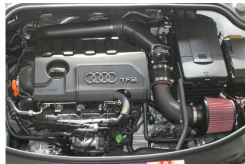
23. Double-check complete installation.

Copyright 2009, NEUSPEED ®. All rights reserved. Reproduction in whole or in part prohibited. DOC.65.10.92 Rev. 01.29.09