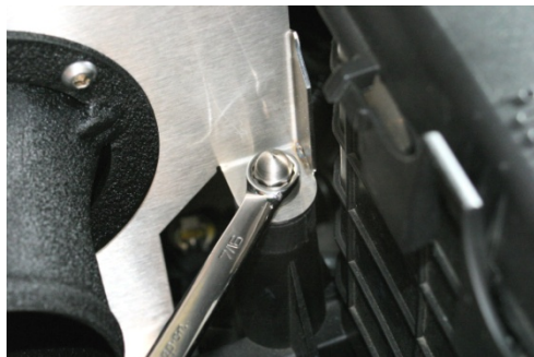
14. Install and tighten acorn nut.