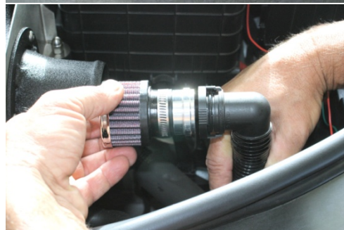
18. Attach mini filter to billet fitting and tighten. Then connect to air pump fitting.