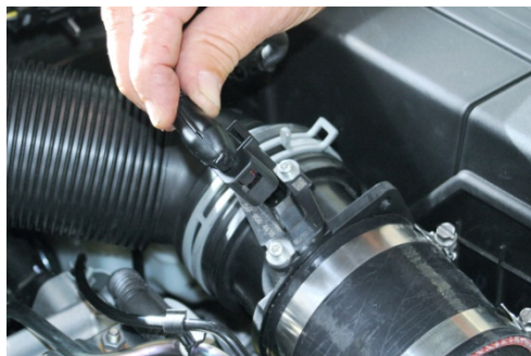
16. Re-attach MAF electrical connector.