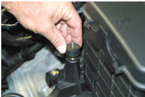
12. Install and tighten rubber isolator into threaded stand-off just in front of battery.