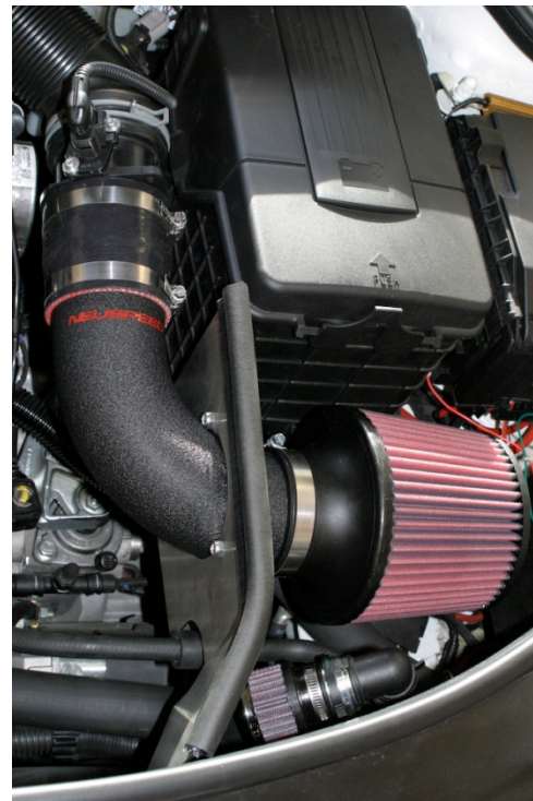
22. Install rubber strip on top-edge of P-Flo bracket.