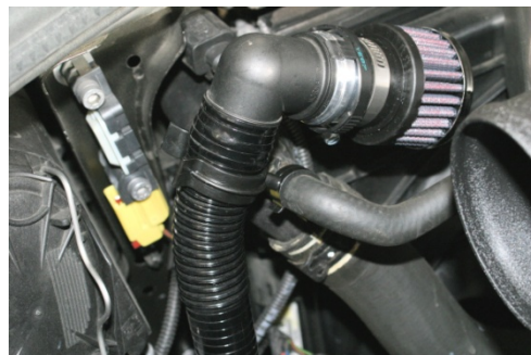
19. Attach black plastic hose support clip from radiator coolant vent hose to air pump hose.