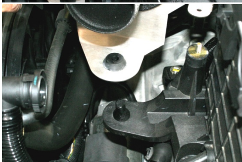
13. First install NEUSPEED intake pipe into silicone hose, then attach P-Flo bracket onto rubber grommet mount and rubber isolator.