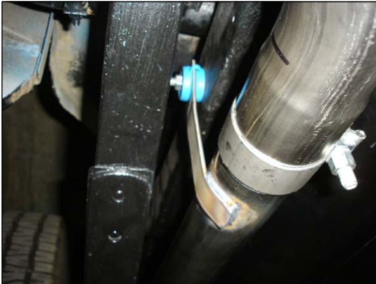
Fig # 2

Step 5: Slip the outlet pipe assemblies to the over axle pipe assemblies. Secure with the supplied clamps. Locate the correct hanger placement on the frame rail adjacent to the leaf springs. Drill 3/8" clearance hole and mount hanger to the frame using the supplied rubber grommet and hardware. (See Fig # 2).