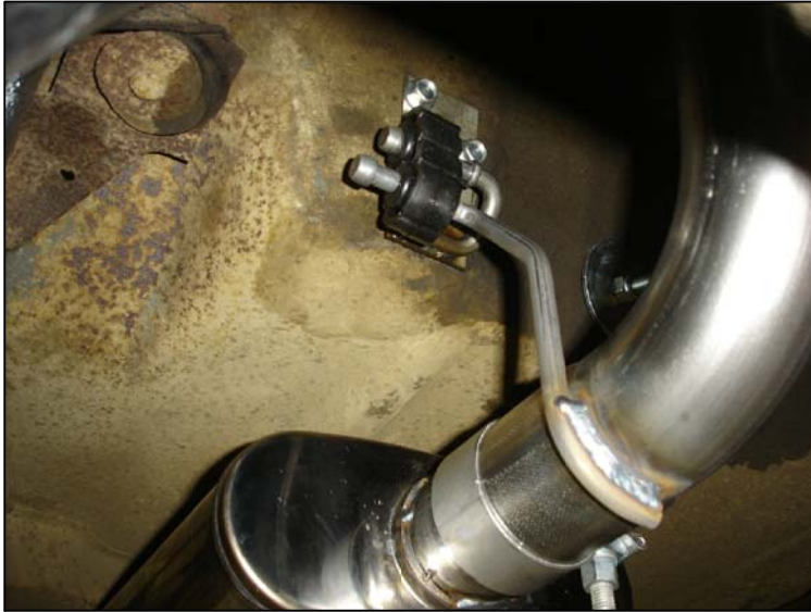
Fig # 1