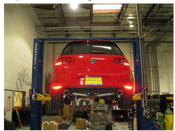
Step 5. Once a final position has been chosen for the new exhaust system, evenly tighten all clamps from front to rear using the torque specifications on page one of the instructions. Inspect all fasteners after 25-50 miles of operation and re-tighten if necessary.