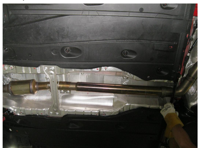
Step 2. Begin installing the new system by inserting the inlet of the Inlet Pipe into the OEM clamp at the catalytic converter. Leave clamp loose for final adjustment.