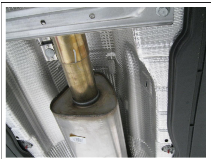
Step 1. Begin by loosening the factory clamp located just behind the catalytic converter. Working rearward extract the hangers from the rubber insulators (retain insulators as they will used in the installation of the new exhaust system). Remove the OEM system from the vehicle.