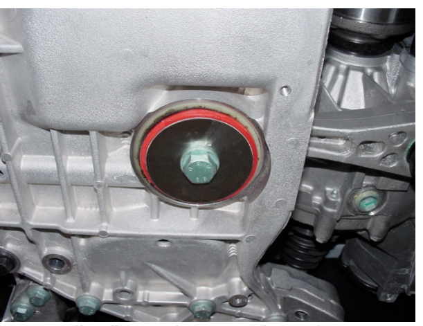
5. Install 3" stainless steel washer on to factory bolt and tighten into mount. Torque bolt to 74 ft. lbs.

©2009, Automotive Performance Systems, Inc. All rights reserved. Reproduction in whole or in part prohibited. DOC.22.10.91 Rev. 02.05.09