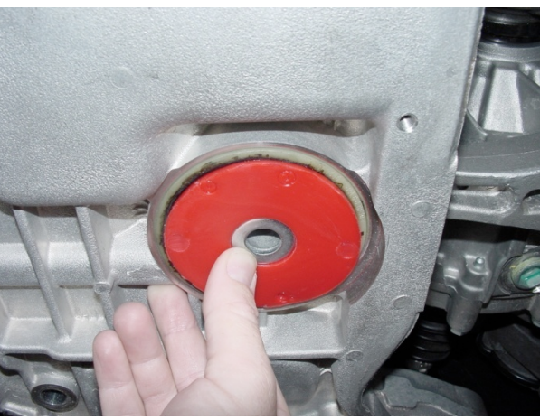
4. Install 14mm washer.