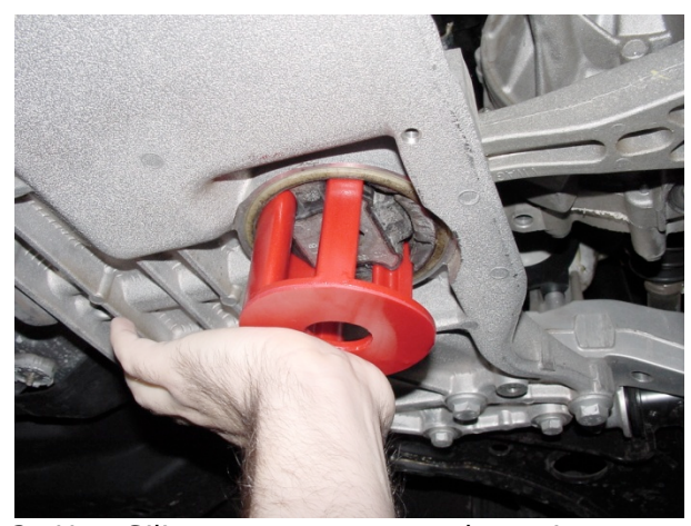
3. Use Silicone spray on urethane insert to ease installation, match up to rubber mount and push up until it bottoms out.