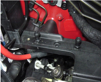
Screws installed after wall removed