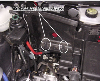
Plastic screws that need to be removed