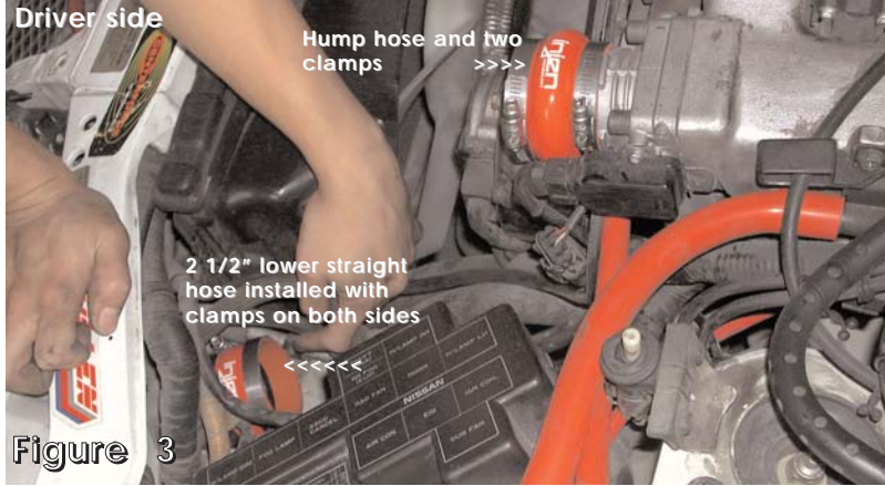
The 2 1/2" straight hose and hump hose have replaced the stock air intake ducts.

Front view of the engine compartment with stock air lines and air ducts removed. The stock lines have been replaced with the new Injen vacuum lines.