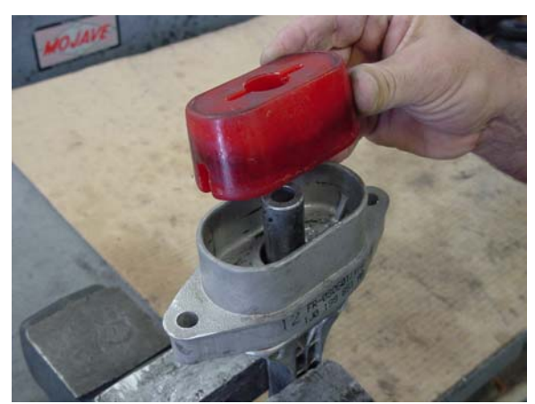
7. Install thick urethane isolator into mount in orientation shown.