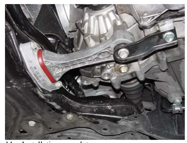
11. Installation complete.