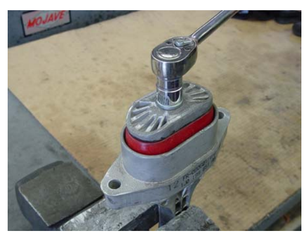
8. Install plate and secure isolator assembly with bolt. Torque to 20 ft-lb.