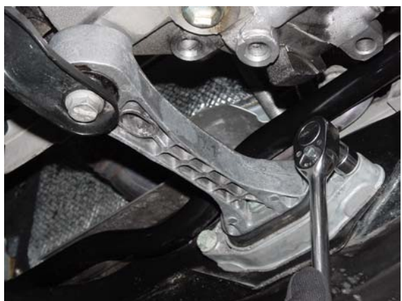
2. Remove two (2) bolts (13mm hex) securing torque link to cross member.

1. Raise vehicle and support with jack stands or lift.