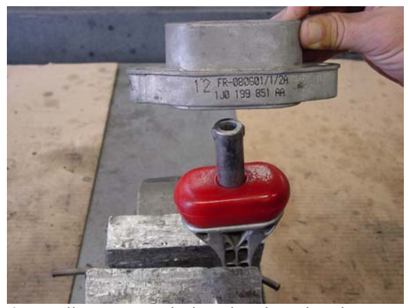
6. Install mount over isolator in orientation shown.