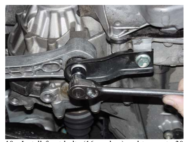
10. Install front bolts (16mm hex) and torque to 30 ft-lb + 90^{\circ} (1/4 turn)