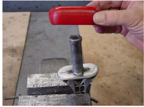
5. Install thin urethane isolator on end of link in orientation shown.