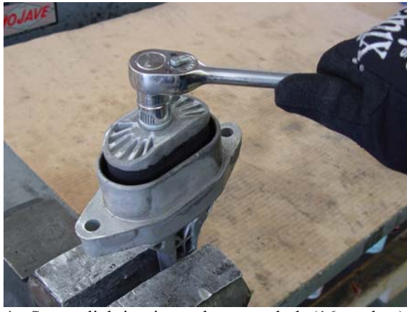
4. Secure link in vise and remove bolt (16mm hex). Disassemble isolator assembly.