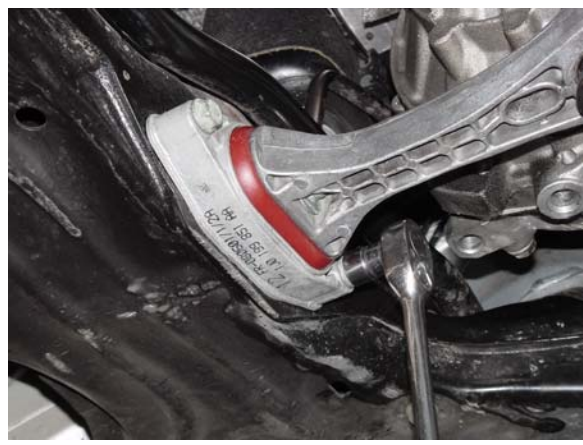
9. Position mount in cross member and install two bolts (13mm Hex). Torque to 15 ft-lb + 90^{\circ} (1/4 turn)